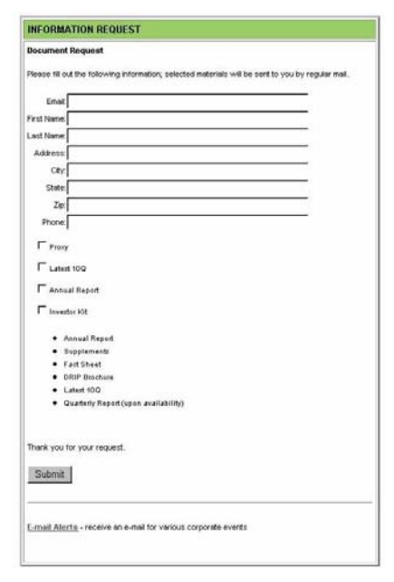
A request form for printed material

materials help reduce offline workload in handling tele-enquiry. (Witner 2000)