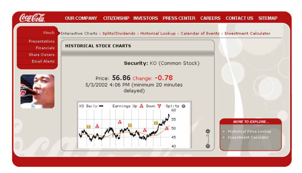
Stock quote: cocacola.com