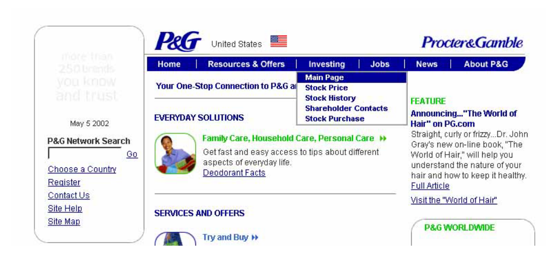
IR section on website: P&G.com

"IR section on Web page" refers to the sub-page in a corporate web site tailored made for IR communications. Usually, the IR section is likely named "Investor", "Investing", "Investor Relations", "Investor Information", "Shareholder", etc.